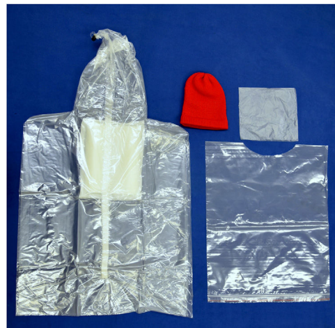
Figure 1 Intervention and control plastic bag.

Both the radiant warmers (target temperature of 36–37 °C) and the transport incubator (target temperature of 35–37 °C) remained ready for use 24 h a day. The servo