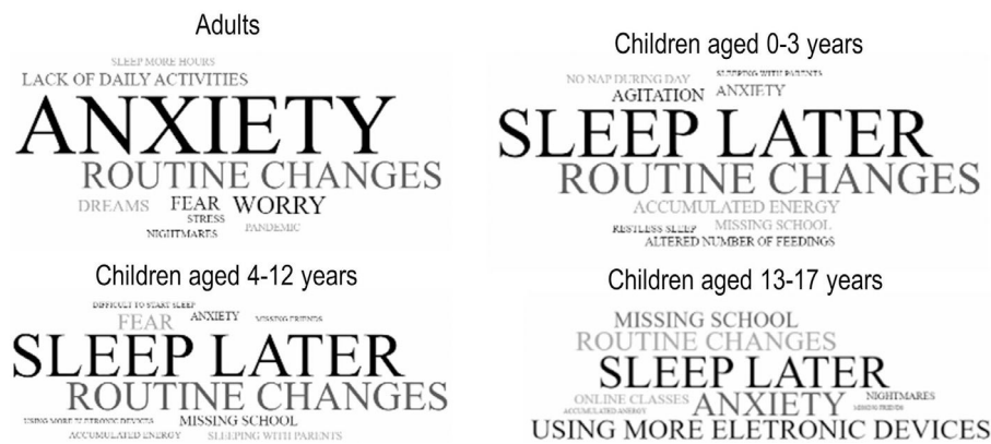
Figure 2 Tag-cloud with 10-most cited terms regarding participant's reason for altered sleep habits.