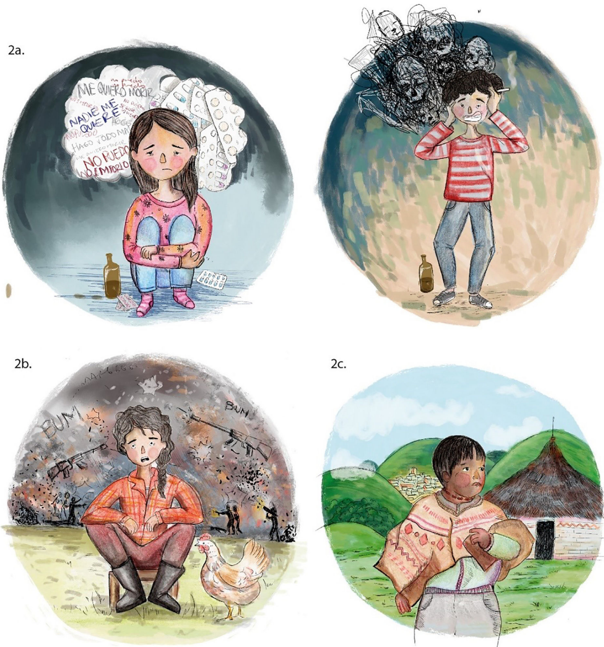
Figure 2 Profiles of the Suicide Attempt in children and adolescents. (2a) “Classic” Profile. (2b) “Related to the armed conflict”. (2c) “Ethnic” Profile.