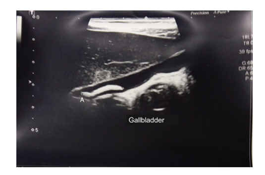
Figure 3 Biliary tract ultrasound. Note Ascaris in the gallbladder (A).

CT scans reveal the worms as cylindrical structures and can be used for better visualization of the dilated ductal system; however, its use should be very judicious and restricted