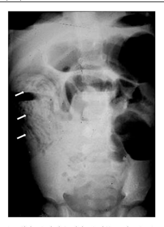
Figure 1 Abdominal plain abdominal X-ray showing intestinal obstruction by Ascaris (arrows).

Contrast-enhanced computed tomography or magnetic resonance imaging may be useful, but are not essential, especially in acute cases, and may be dispensed. In most cases, a simple abdominal radiography is the only necessary examination. The investigation may be performed or complemented, in cases of complications in US.<sup>2,7</sup> The main differential diagnosis is acute appendicitis because of the similarity of signs and symptoms between the two diseases.<sup>7</sup>